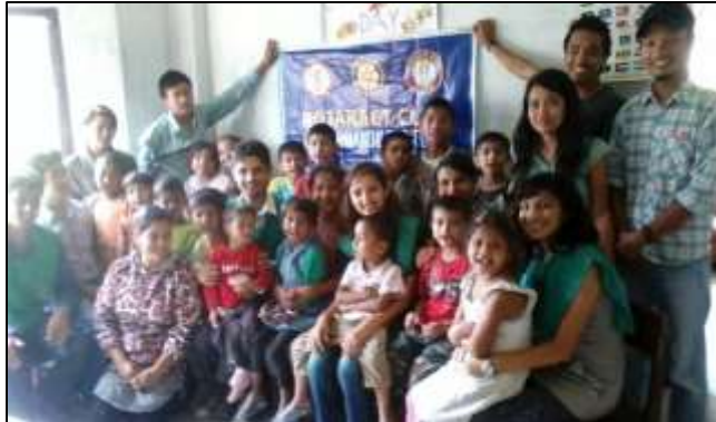
Celebration of Children day: Rotaract spend quality time with the children of "Baby Life Home" Kirtipur children suffering from HIV

Empowering disadvantaged women with support to the Tailoring Center at Mary Ward /Jhamsikhel with supply of carpet, fan & material courtesy from mentor